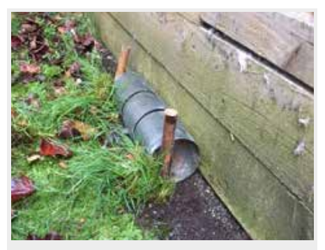
Trapping is an excellent means of rat control. Always set traps in robust tunnels to reduce access by non-target species. Check traps at least daily!

A system of tunnel traps is often used as part of a managed programme of pest and predator control. This helps prevent rats from becoming a problem at release pens and in hedgerows by keeping up constant control pressure on them. Even considerable