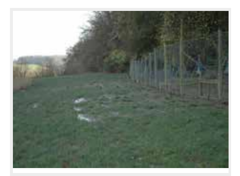
Give careful consideration to feeding arrangements at release sites as feed inevitably attracts rats!

Active Gun Clubs provide supplementary feed in their hunting territories throughout harsh Winter and 'hungry' Spring months, using barrel feed hoppers that are strategically placed throughout their reserves. Feed provided can benefit many wildlife species, however recent research showed that the main beneficiaries of game feeders on lowland farmland were rats, mice, corvids and pigeons (see further reading list).