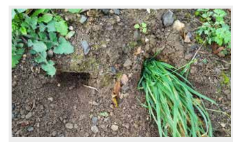
Lightly block baited rat burrows with grass, paper or straw to help prevent bait being expelled. Check burrows daily and clear up any bait that has been kicked out