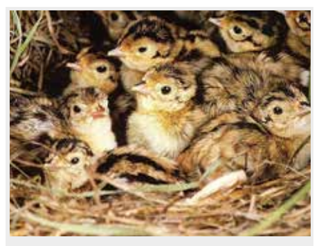
Rats are voracious predators of the eggs and chicks of game-birds

Feed for poults, either grains or pellets, whether offered from open troughs or from hoppers, is highly attractive to rats and encourages the development of a serious infestation!