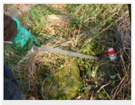
Burrow gassing is a specialist operation to be done by trained operatives. It is not likely to cause harm to wildlife when only rat burrows are gassed!

because, when used in the approved manner, adverse impacts on non-target animals are rare and no significant residues of fumigants remain in the environment or enter the wildlife food chain.