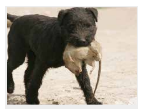
Terriers & other dogs may be useful in taking rats in some circumstances

Fumigant gases, evolved by the application of phosphine gas generating tablet and pellet formulations, provide a very effective method for rat control. The use of fumigants has the added benefit that its effects are virtually immediate. Burrow fumigation should be used in preference to the application of anticoagulant baits