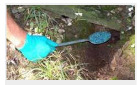
If a rodenticide must be used it is best to bait rat burrows. Place the bait as far as possible into the burrow using a long-handled spoon!

The application of bait directly into rodent burrows is a preferred method of