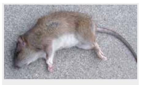
Poisoned rats carry residues that can be passed on to wildlife that feed on them!

and in accordance with the Best Practice Requirements published by the Campaign for Responsible Rodenticide Use Ireland (CRRU Ireland) (http://www.crru.ie), and with the CRRU Code, which is reproduced at the back of this booklet. That guidance is intended to reduce both primary and secondary exposure of wildlife to rodenticides, thereby minimizing the risks arising for wildlife associated with their use.