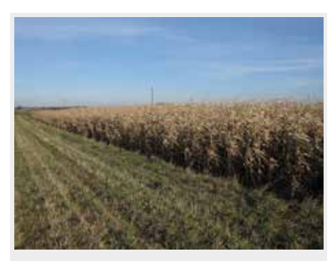
Game crops provide food and cover both for game birds and for rats. It is good practice to have a wide margin between cover and the crop so that rat runs are readily visible